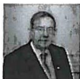
Éamon Ó Cuív