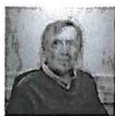
Minister for Agriculture, Food and the Marine

Ballyness Bay is located within Ballyness Bay Special Area of Conservation (SAC) (Natura 2000 site). All aquaculture activities in Natura site areas require an Appropriate Assessment to be carried out before any aquaculture licensing determinations can be made. My Department is working with the Marine Institute, Bord Iascaigh Mhara and the National Parks and Wildlife Service to achieve full compliance with the EU Birds and Habitats Directives through a multi-annual work programme. This data collection programme, which is substantially complete, together with the setting of Conservation Objectives, will enable all new and renewal aquaculture applications to be assessed.